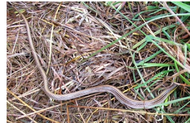
The striped legless lizard: this endangered species is the subject of investigation by Brett Lane at the Tuki Wind Farm site.