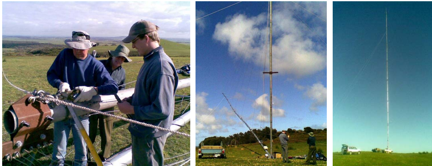
Data Tower Installation. A combined effort of Enviromet, Wind Power and a local land owner saw the recent erection of a 60m data tower.

Reference: Renewable Energy Focus, September Issue 2007.